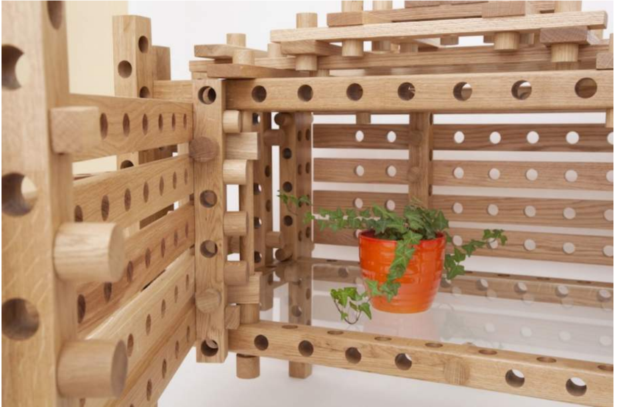
the piece aims to bring back memories of playing with construction wood blocks