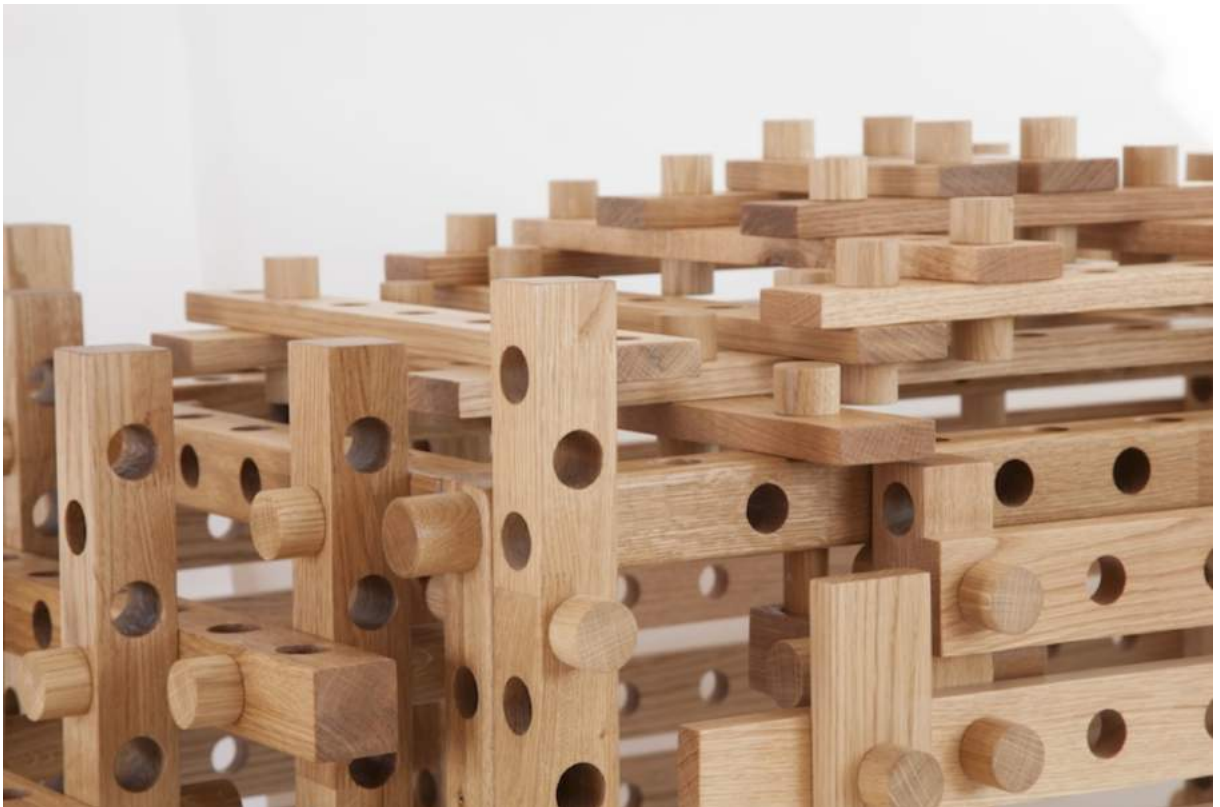
a close up detail reveals the richness of the design